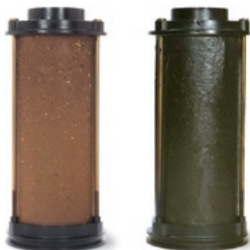
MOBIL DTE 732